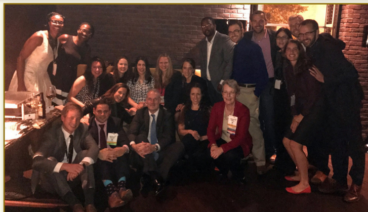
Department residents and faculty at the Department of Surgery & Henry Harkins Surgical Society Reception during the 2016 American College of Surgeons annual meeting.

Dear Harkins Members, Fall 2016 was an exciting time for the Henry Harkins Surgical Society! The festivities began with the Annual Meeting and Dinner on October 14th at the UW Club, where we inducted the current chief residents into the Society and celebrated their accomplishments and final countdown as our trainees. Please join me in welcoming the graduating class of 2017: